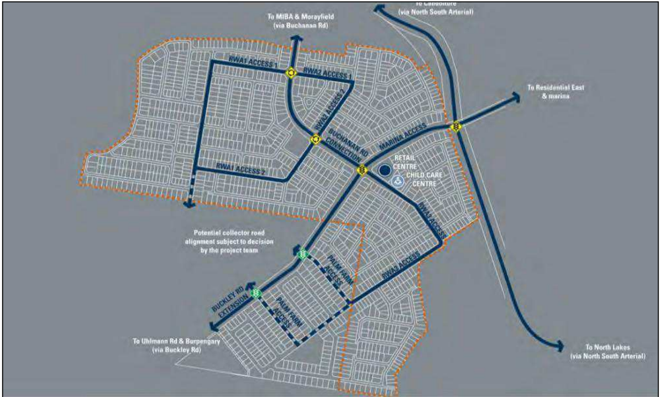
Figure 5-1 Major Roads Near the Development

Roads near the development consist of sub arterial roads and collector roads. These are shown in Figure 5-1.