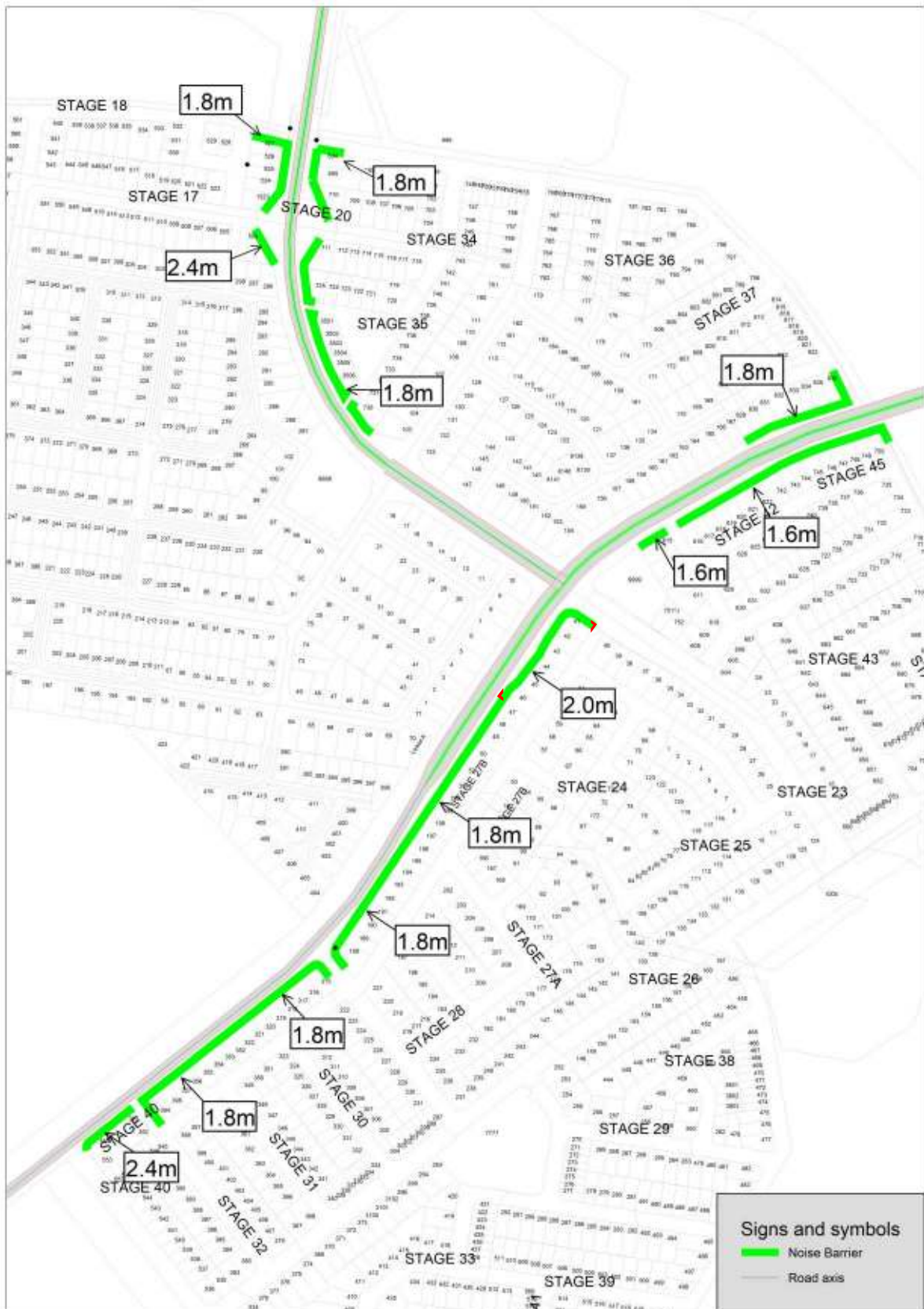
Figure 5-2 Location and Heights of Noise Barriers for Stages 14 to 45